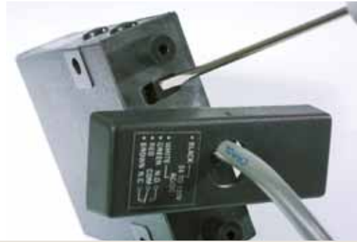
On or Off Delay Switch