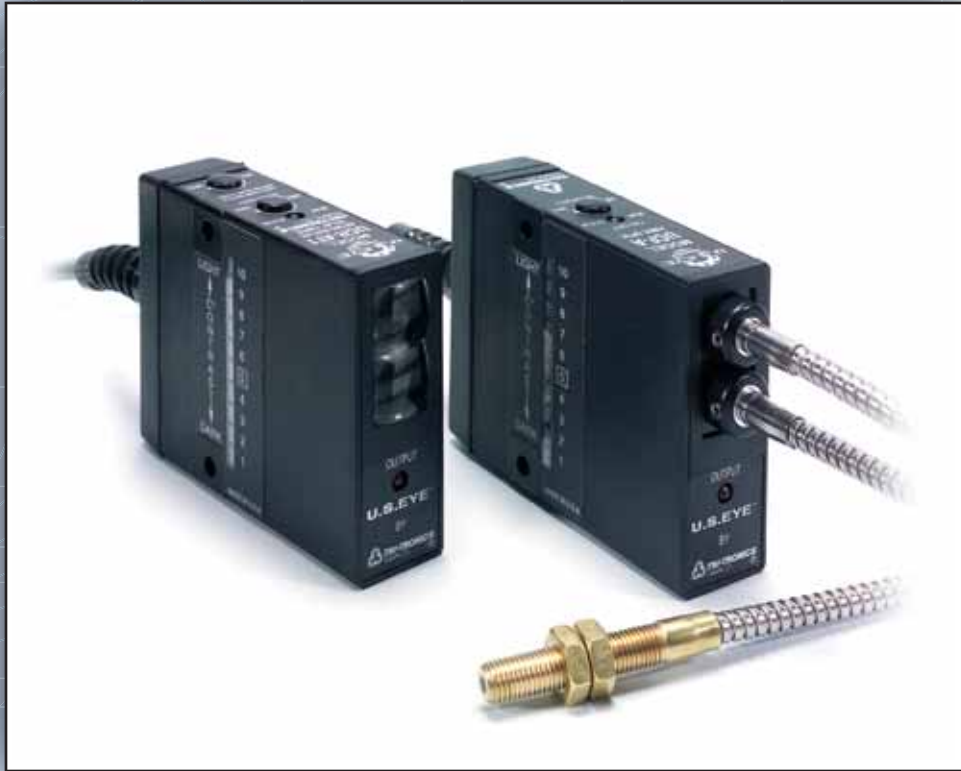
General Purpose AC/DC Photoelectric Sensor